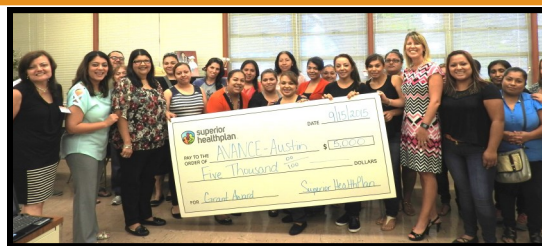
On September 15, Superior HealthPlan posed with AVANCE parents with a check for $5,000.

You can donate online at austin.avance.org . Thank you for your support!