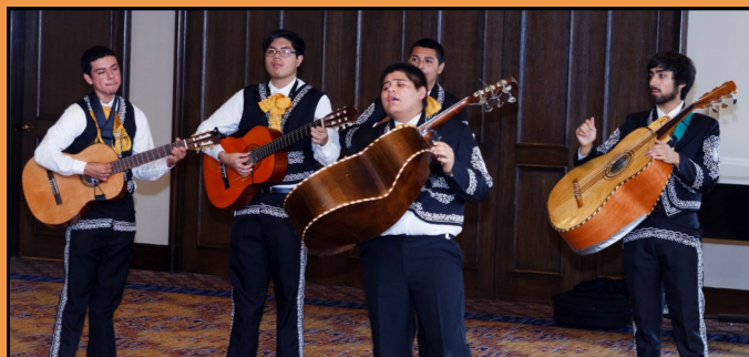
Crockett High School's Mariachis de Oro serenaded guests

work of AVANCE and premiered our new video, "The Future is NOW," which can be viewed at Austin.avance.org .