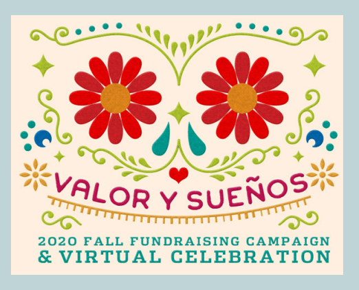
Support our goals by making a donation this month at www.avanceaustin.org